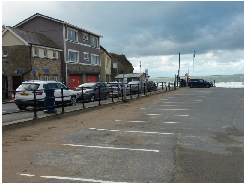
The Car Park