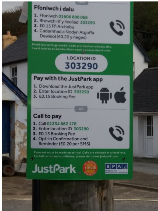
Alternative means to pay advertised