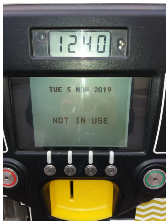
Pay Machine and signs

'Not in Use' information which appeared on the pay machine immediately I tried to use it